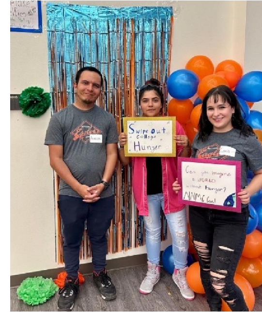
○ Student Employees

CASSC is located in the Teacher Education Center, on the 2nd floor (#210 - #213).